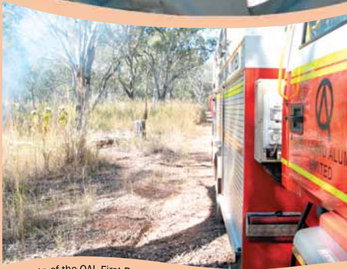
File photo of the QAL First Response team conducting controlled backburns.